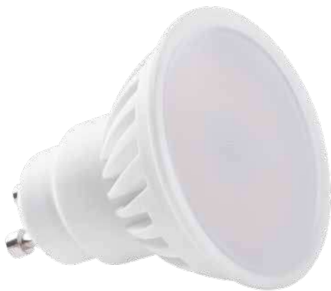
TEDI MAX LED GU10-WW