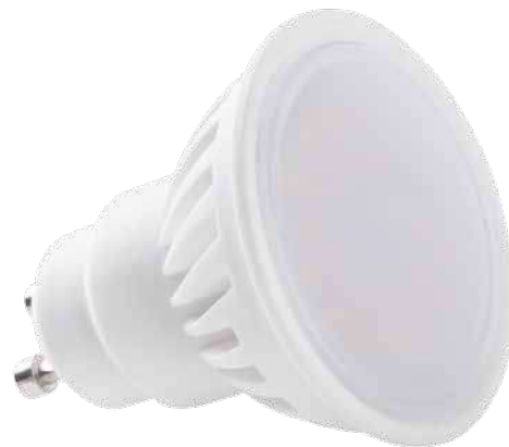
TEDI MAX LED GU10-CW